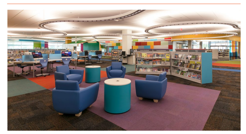
We look forward to partnering with you throughout the school year.